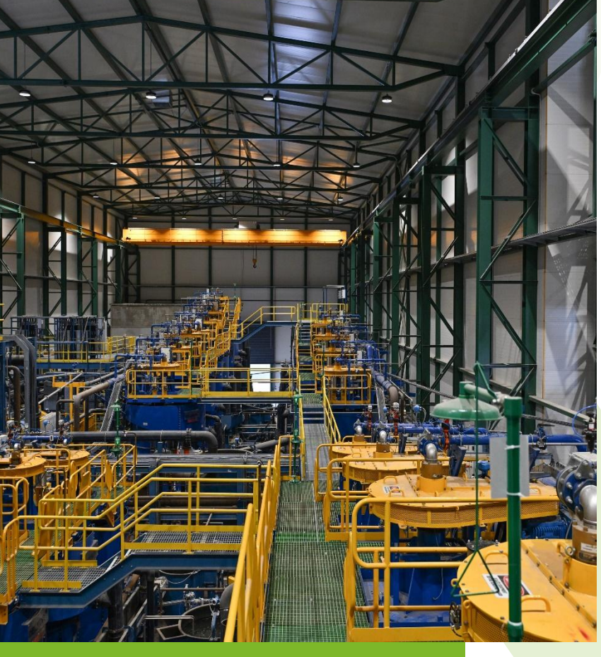
Vares Processing Plant