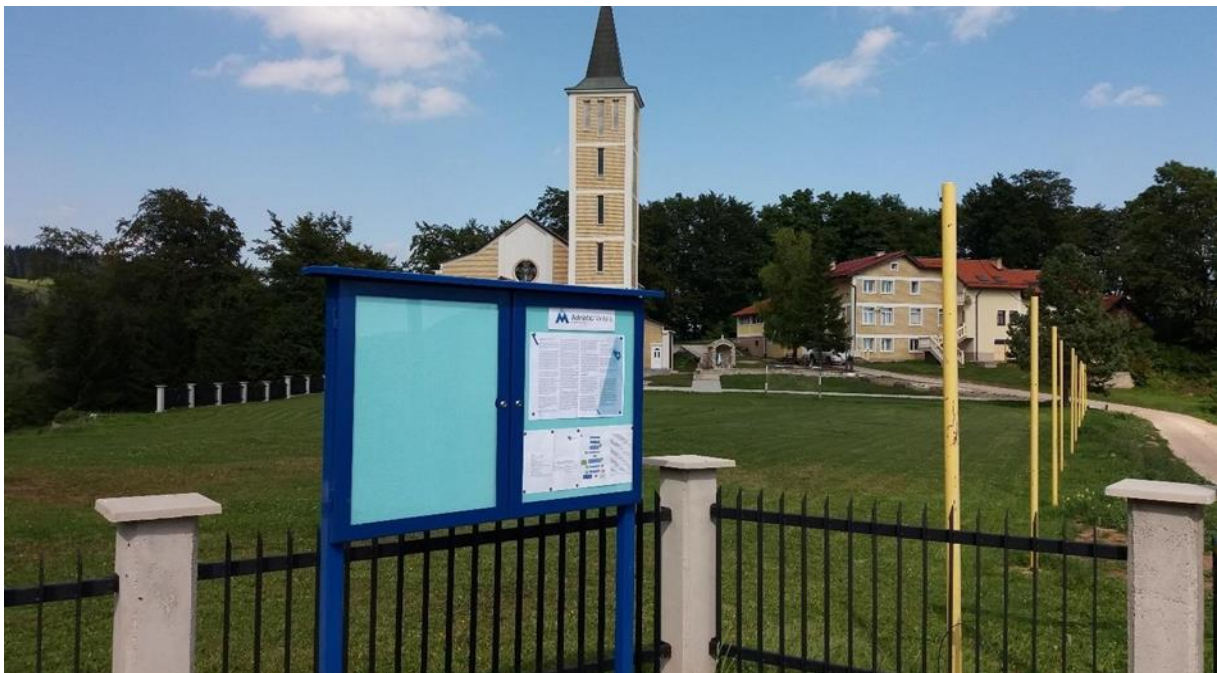
Figure 4.1.2. Bulletin Board Borovica

Document and reports, that are too large to display on the bulletin boards are made available, in Bosnian, at the Info Centre, and are downloadable from the Adriatic Metals BH website and are available to or through representatives of local communities.