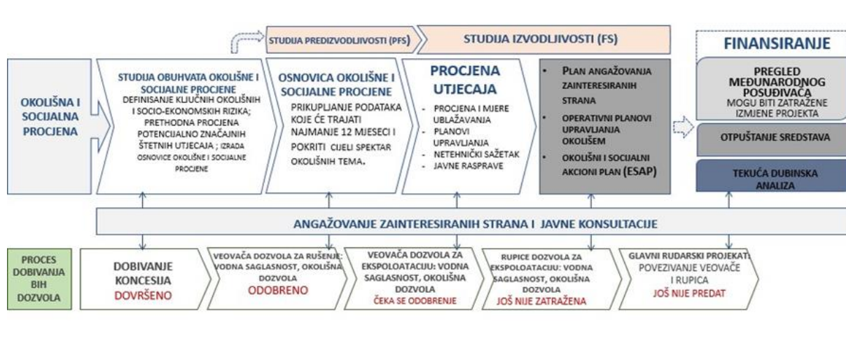
Figure 1.1 ESIA Process aligned with Technical Studies and BiH Permitting Process

Stakeholder consultation is a vital component of the ESIA process and technical studies. The consultation was initiated during the scoping study for the ESIA and has continued throughout the baseline period and once the impact assessment documentation was completed in the draft. Key stakeholders were identified and interviewed as part of this process and engagement with them was and is ongoing.